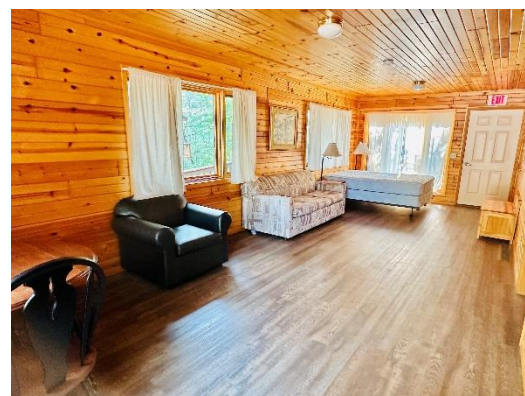
Cabins 4 & 5 Family style cabins