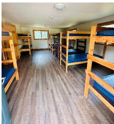
Bunk room in Cabins 1-4 7 twin size bunk beds