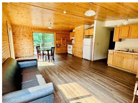
Living area in Cabins 1, 2, 3 & 6 Cabins 1 & 6 have no appliances