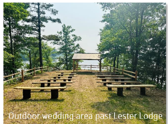
Outdoor wedding area past Lester Lodge